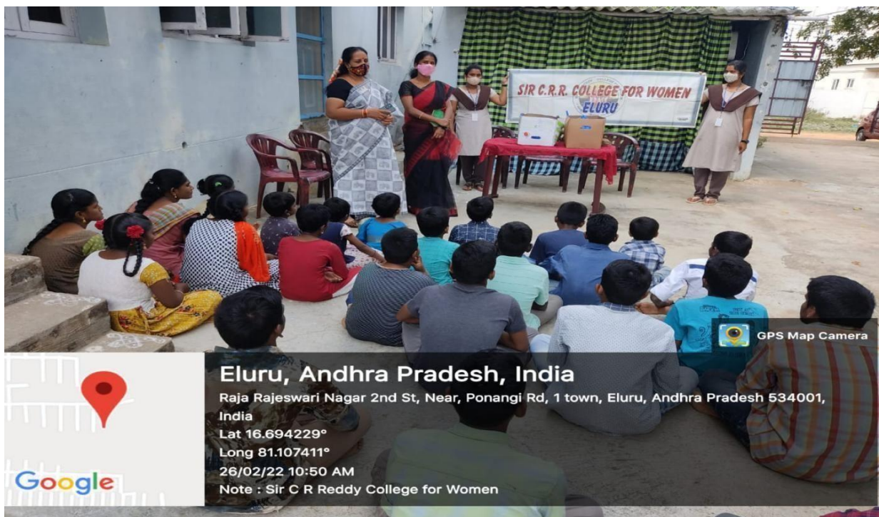
Distribution of fruits and sweets to the children in Rajarajeswari Child Welfare